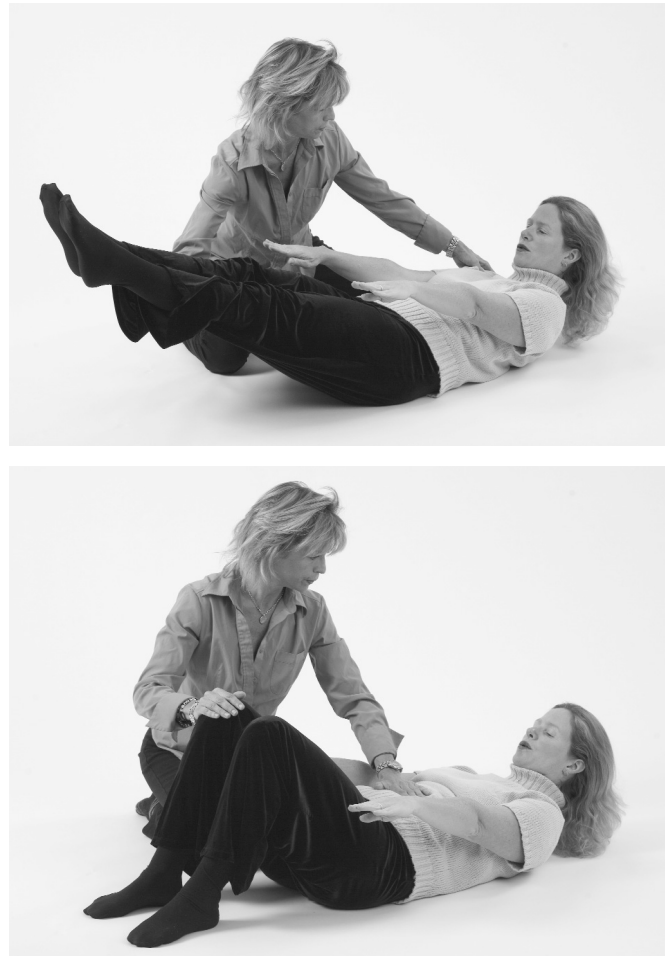
FIGURE 6.15 Interplay between instructor and client with Pilates exercises.

Exercise can be extremely effective in promoting the health of the body in general and the low back in particular. All exercise requires careful attention to the body's mechanics and to the mind-body continuum. Exercise is also an extremely effective form of stress release; this in and of itself may be one of its most salient features. As with the more specific exercises described in the preceding sections, a general exercise program should be started following clearance from the patient's clinician.